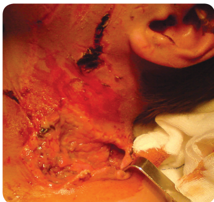
Figure 5. Case 8: 13-year-old boy's cervical wound on admission to the emergency department.

The parents were pleased because they could take part in their children's treatment and recovery, which helped to reduce stress levels. They were hesitant at the start of the home treatment, but all parents reported that after the first few days of applying the dressings on their children's injuries, they found the nursing procedure easy. They also reported that the treatment was emotionally fulfilling, because they could observe the wound healing process themselves and better reassure their children, who reported reduced or a complete lack of pain.