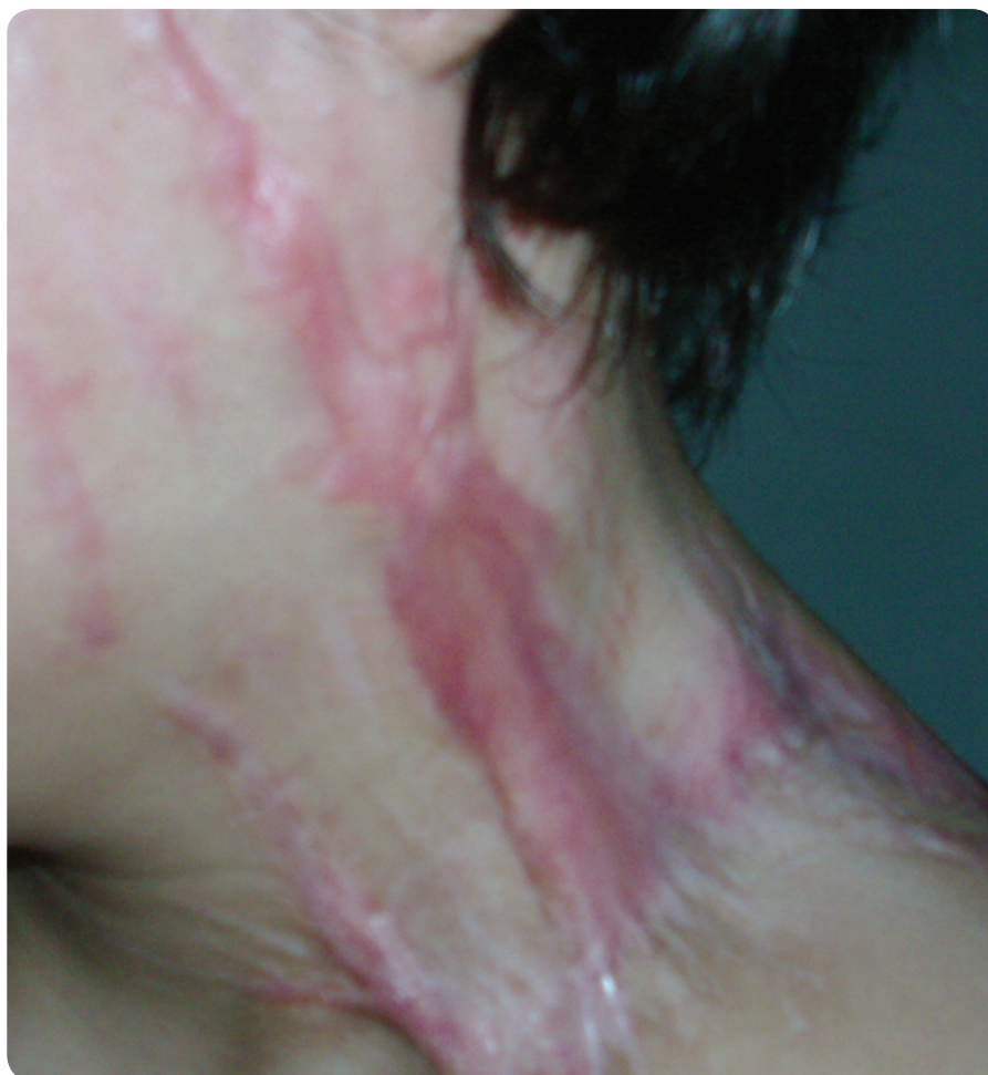
Figure 6. The same wound two months after epithelialisation.

In a randomised comparative trial between honey and SSD with 150 patients who each had two wounds treated with either SSD or honey, the