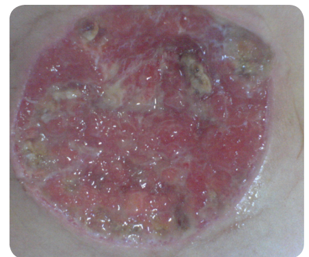
Figure 3. Case 7: lesion on the patient's right armpit at the start of honey treatment.