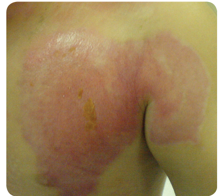
Figure 2. Case 3: the scald was fully healed after 14 days of honey treatment.

Ten days after starting treatment, case 8 experienced progressive granulation in the traumatic area, making it possible to suture the inner layers of the deep traumatic cavity, while continuing the medication. One