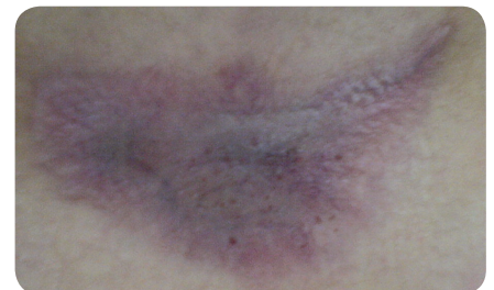
Figure 4. Case 7: the lesion healed after 30 days.

week later the wound edges were re-approximated. The final result after one month's treatment was excellent, with scar formation which was treated by conservative methods.