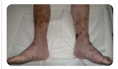
Figure 7. At final review the oedema had subsided and no further treatment was required.