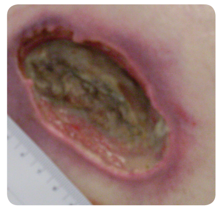
Figure 2. Mrs EK's wound post debridement.