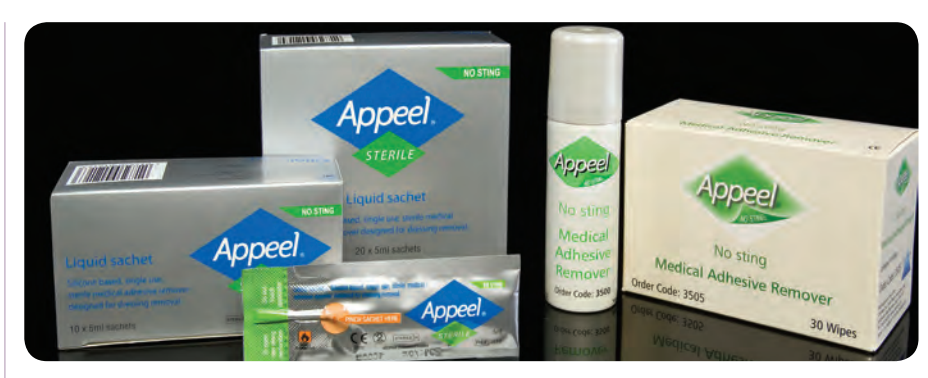
Figure 1. Range of Appeel products.

The sterile presentation of Appeel Sterile sachet means that it can be used