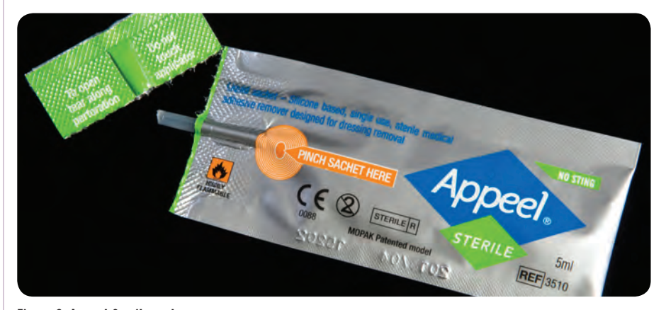
Figure 2. Appeel Sterile sachet.

on broken skin, eliminating any risk of infection to the patient. It is suitable for use on any type of wound and patients of all ages. As with other products in the Appeel range, once the silicone liquid has come into contact with the dressing it changes the chemical balance of the skin, making the adhesive temporarily inert. This facilitates the safe, pain-free and nontraumatic removal of the dressing.