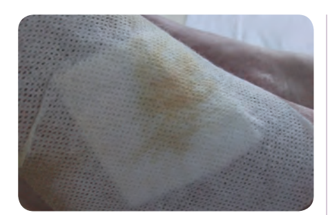
Figure 3. Mepore dressing in situ.