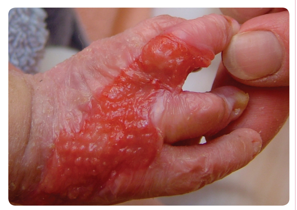
Figure 3. Baby A's hand wound at five months. The wound has shrunk in size, with epithelial migration.

had chosen not to be involved (Fine et al, 2005).