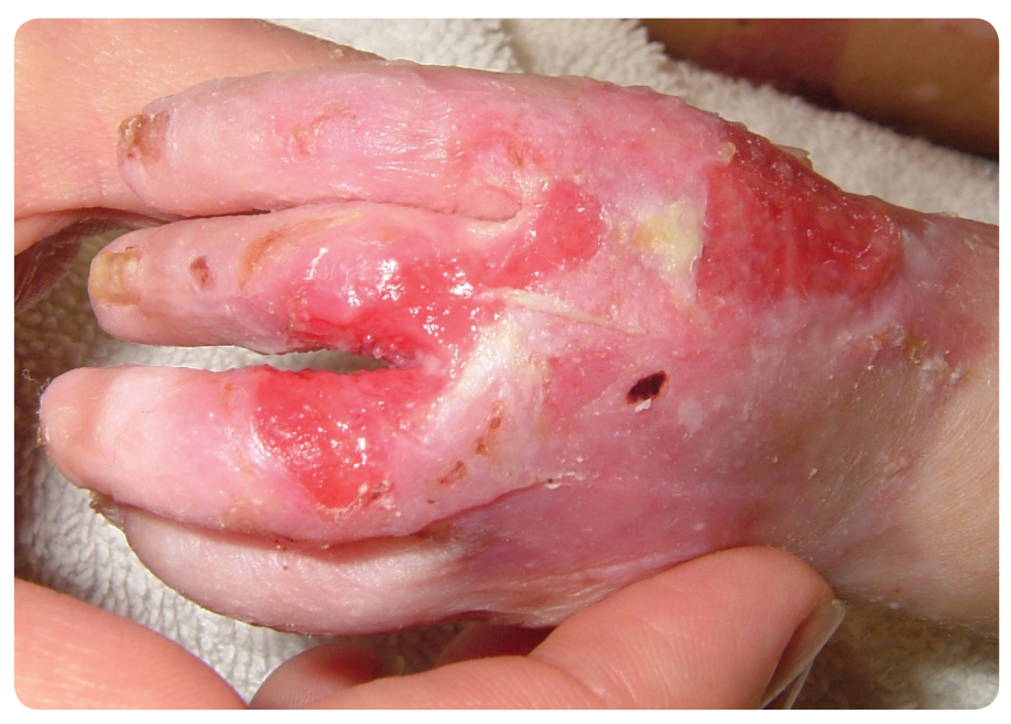
Figure 2. Baby A's hand wound at three months old showing epithelial edging and minimal hypergranulation.