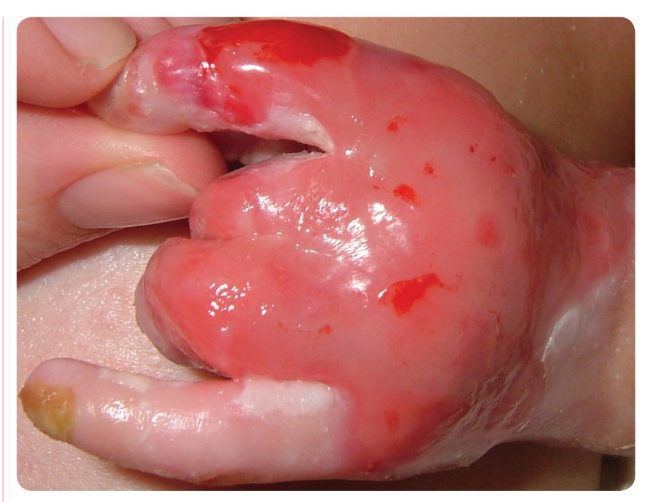
Figure 1. Baby A's hand at eight weeks old when daily baths and dressing changes were being carried out.

At this centre wound care for babies with EB traditionally centres on daily bathing and dressing changes. A non-adherent primary dressing of soft silicone mesh and a secondary dressing