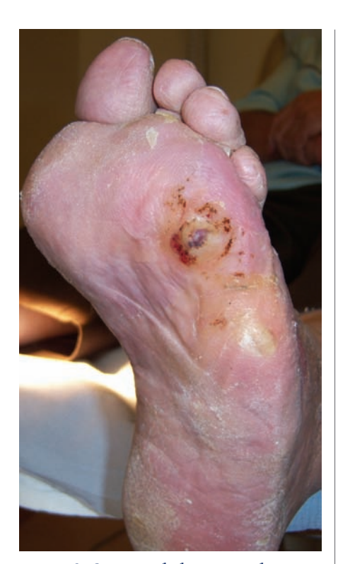
Figure 2. Structural changes with ulceration in a patient with diabetes.

shoe and external floor surfaces, resulting in tissue damage. Repetitive high pressure at sites of deformity can be particularly detrimental for individuals with diabetes as tissue breakdown can occur. Callosities can also develop at sites of high pressure — these can thicken, haemorrhage and eventually ulcerate ( Figure 3 ) (van Schie et al, 2004).