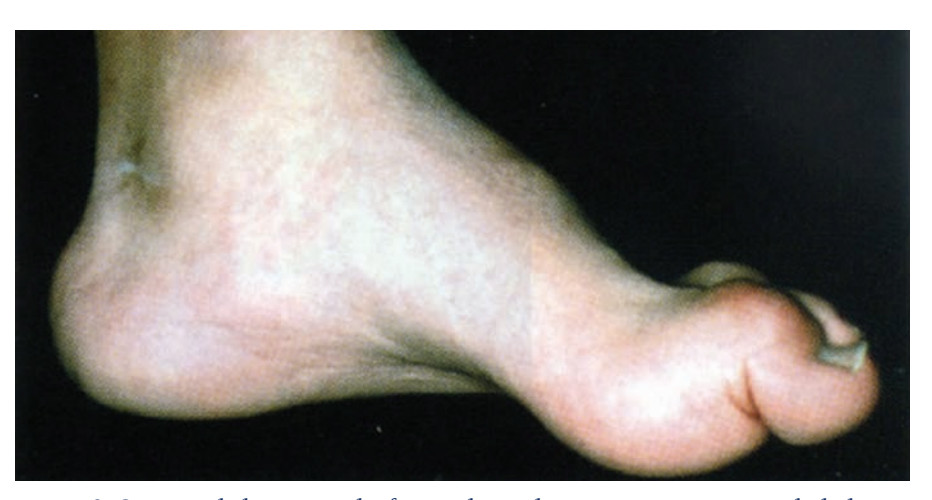
Figure 3. Structural changes to the foot without ulceration in a patient with diabetes. This is a classic image of a deformed high arch foot (pes cavus) affected by motor neuropathy where the muscle bulk in the arch region is much reduced.