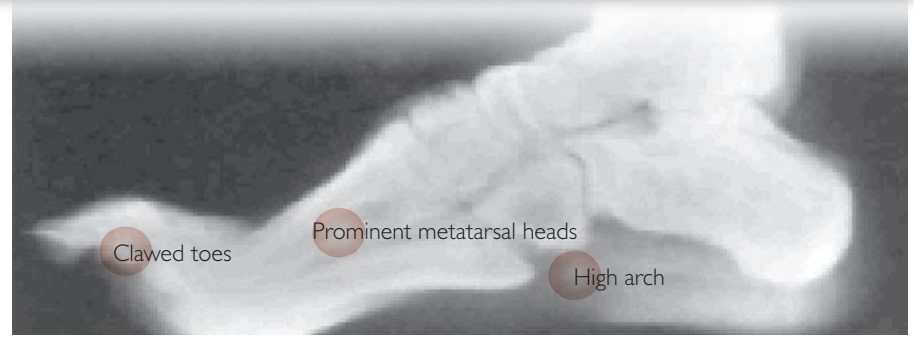
Figure 1. Classic structural change in the foot due to motor neuropathy as seen on X -ray.

Common clinical tests that specifically assess sensory loss include monofilaments, for light touch, and tuning forks, for vibration perception. The