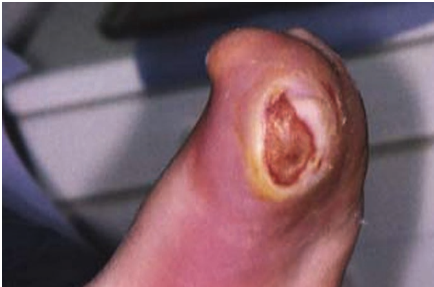
Figure 5. Painful ulceration on the ball of the foot.

response to the application of deep pressure, the pain may be interpreted at a site remote from the site of application