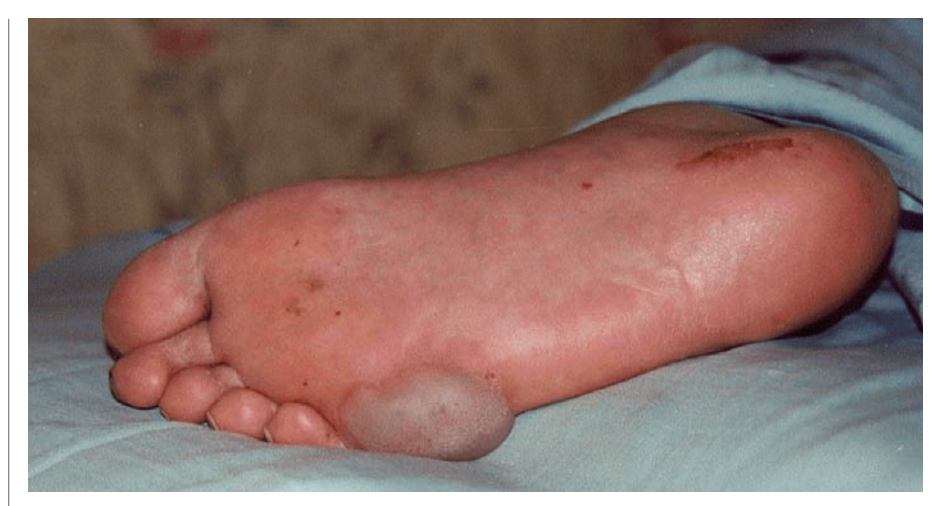
Figure 2. An intact blister Grade 2 pressure ulcer of the foot.

Pressure is the major cause of pressure ulcers, however, other forces such as friction and shear are also implicated in their development (Clark, 2006). Shearing force occurs when the skin remains stationary and the underlying tissues shift. Friction takes place when the skin moves across a coarse surface,