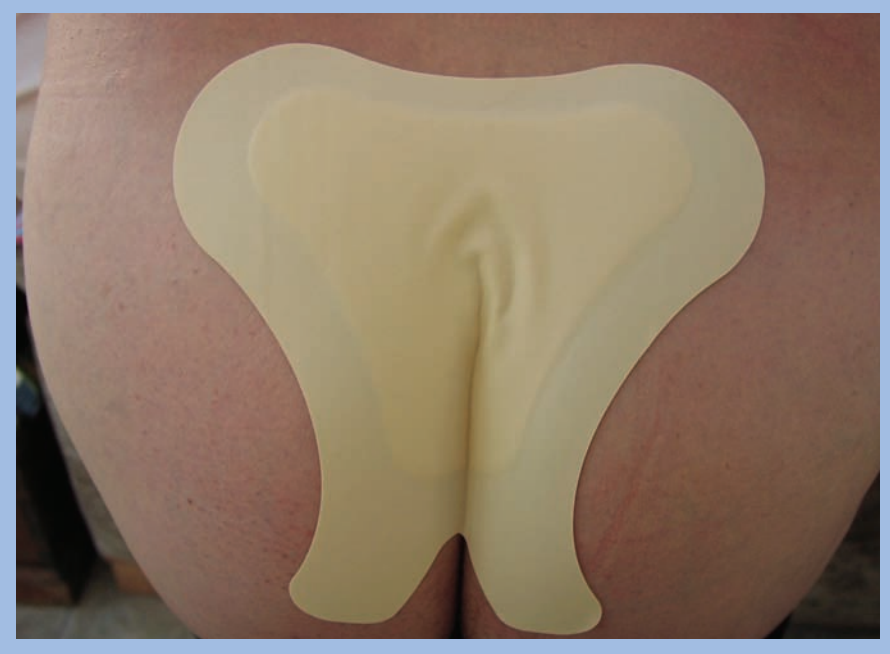
Figure 3. A sacral dressing.