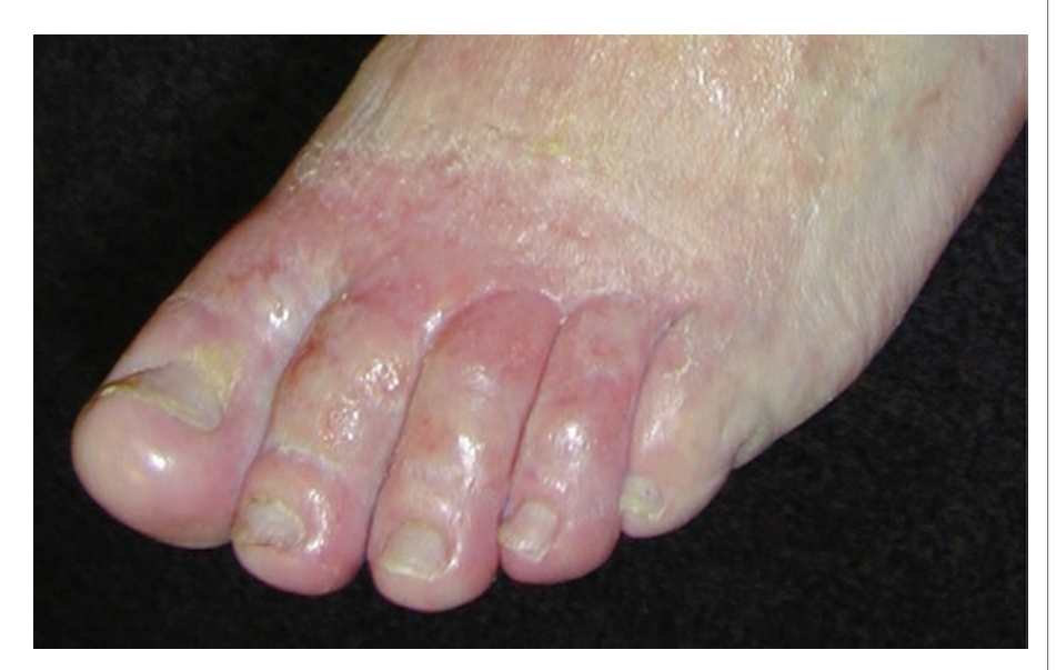
Figure 3. Swollen toes.

develop leading to a chronic oedema (Green and Mason, 2006).