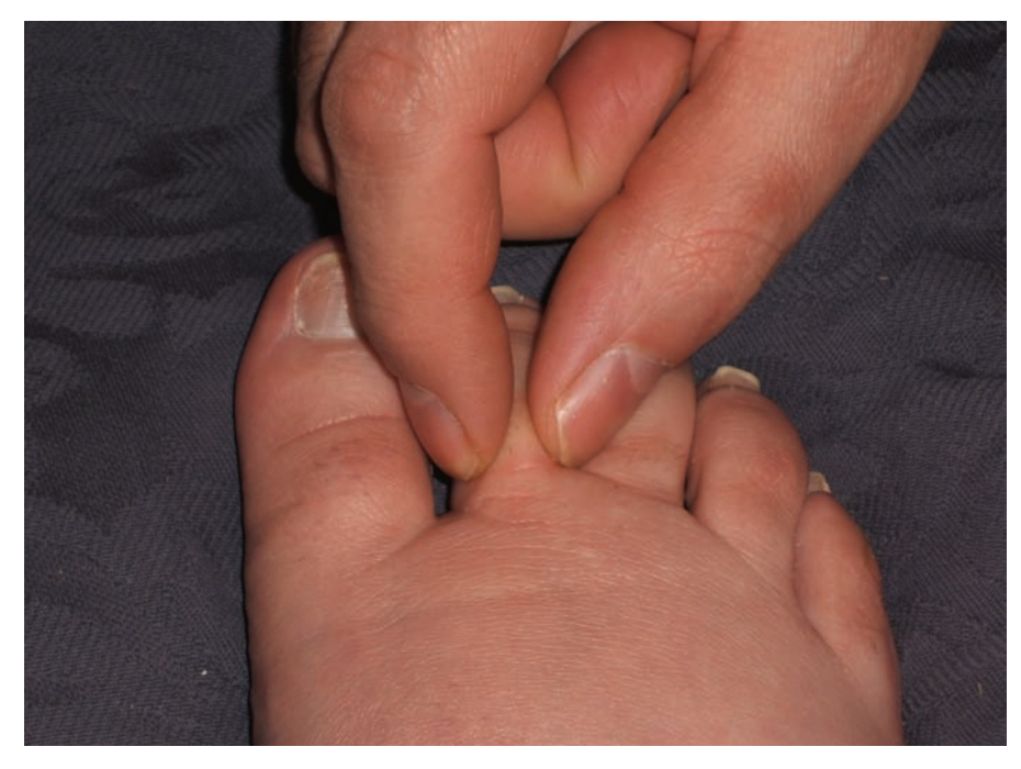
Figure 6. Positive Stemmer's sign.

When the muscles contract and expand (e.g. during exercise) they press against the bandage and the pressure in the limb temporarily increases. This increased 'working' pressure stimulates lymphatic pumping and reabsorption of lymph (Moffatt, 2000).