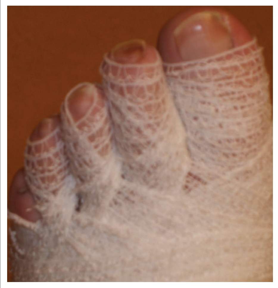
Figure 5. Toe bandaging.