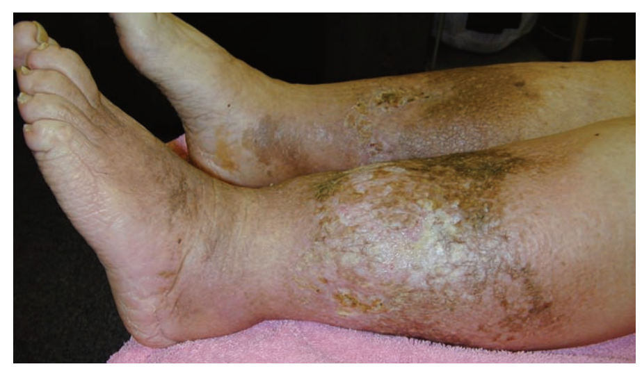
Figure 7. Hyperkeratosis and skin creases.

and oedema. Patients with chronic oedema are at an increased risk of infection if the skin is dry and cracked. This can lead to cellulitis and further deterioration in their oedema. The skin integrity of the unaffected skin must be maintained. Moisturisation of the skin is essential to maintain its hydration. An appropriate dressing should be used to protect the skin around the wound (peri-wound) from maceration (breakdown caused by moisture), which can occur if excess fluid (exudate) from the wound is left in contact with the skin. Consultation with tissue viability specialist will be of benefit in patients with complicated ulcers. Referral should be made if there is any doubt concerning management.