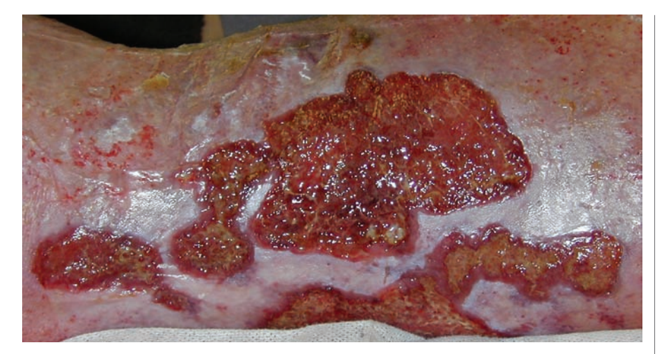
Figure 2. Ulceration and maceration of the surrounding skin and oedema around the ulcer.