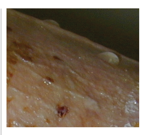
Figure 8. Lymphorrhoea.

MLLB is contraindicated for patients with: