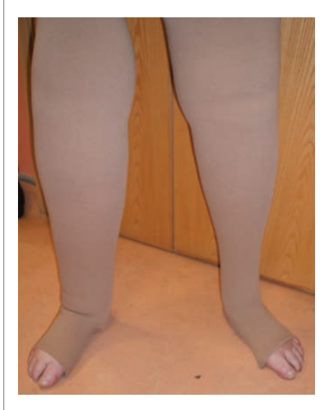
Figure 10. Compression hosiery was used to maintain limb volume reduction.

loss in both thighs following a crush injury. He consequently developed lymphoedema of both legs and underwent a course of decongestive lymphatic therapy to reduce the swelling to his right leg in 1999. Following the use of compression hosiery on both limbs, the swelling was contained. In 2005 he developed a deep vein thrombosis (DVT) in his left thigh and went on to develop symptoms of chronic venous insufficiency in addition to lymphoedema. He developed a small ulcer to the medial aspect of the ankle above the mallelous of his left leg that was treated successfully.