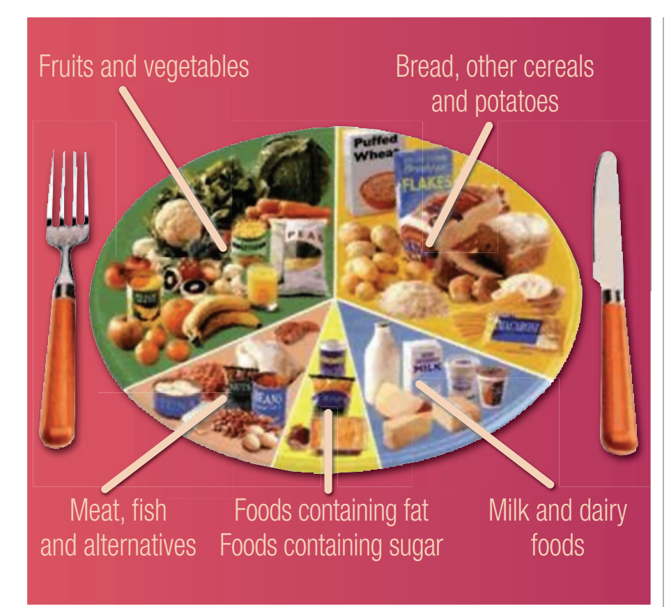
Figure 2. The Plate Model illustrates healthy eating by recommending appropriate amounts from each of five food groups (FSA, 2002).

healthy, varied diet, high in fibre, low in salt, refined carbohydrate and fat (especially saturated and trans fat). A healthy diet should include five portions of fruit and vegetables daily. Individuals should be encouraged to consume an appropriate level of alcohol. Men are advised to drink no more than 3–4 units of alcohol daily and women no more than 2–3 (Food Standards Agency [FSA], 2002; Figure 2; Table 1 ).