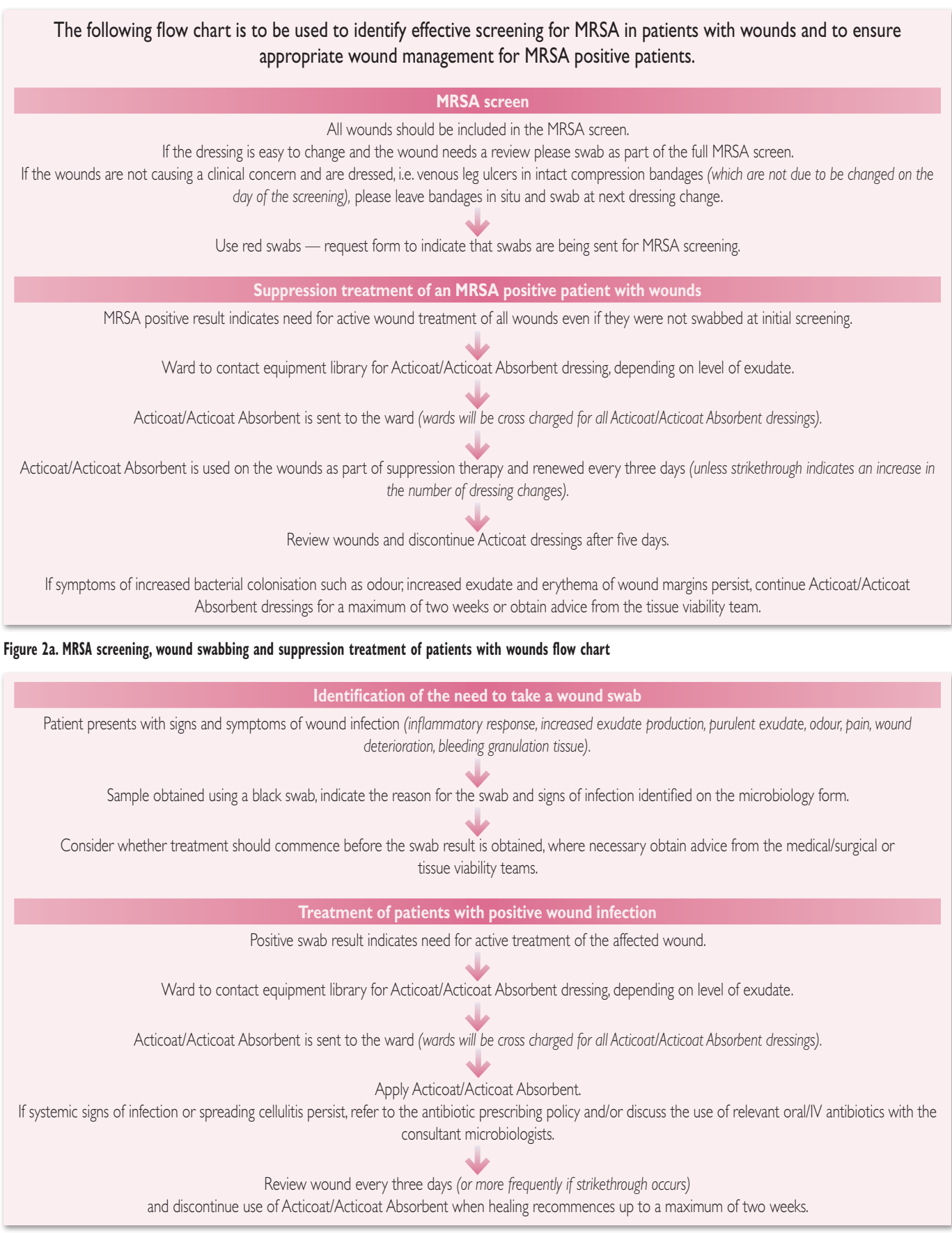
Figure 2b. Flowchart for swabbing and management of patients with suspected wound infection.