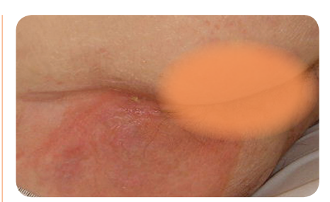
Figure 3. Sacral area showing clinical features of blanching hyperaemia.

Friction is a complex phenomenon which depends on complex physical science and engineering concepts. In simplistic terms, within the context of friction-induced tissue damage, we are referring to kinetic friction. Kinetic (or dynamic) friction occurs when two objects are moving relative to each