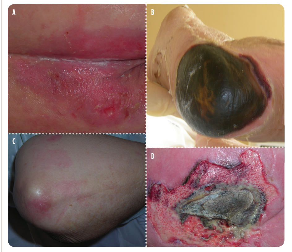
Figure 1. Pressure ulcers: A. Moisture damage to the sacrum; B. Presumed full-thickness damage under eschar; C. Blanching hyperaemia to elbows; D. Mixed levels of tissue damage, grades 1, 2, 3 and possibly 4.

community environments (Weir, 2007; Stotts and Wu, 2009) and are reported worldwide by numerous authors and agencies (European Pressure Ulcer Advisory Panel [EPUAP], 2003; Clark et al, 2004; National Institute for Health and Clinical Excellence [NICE], 2005). US estimates of pressure ulcer