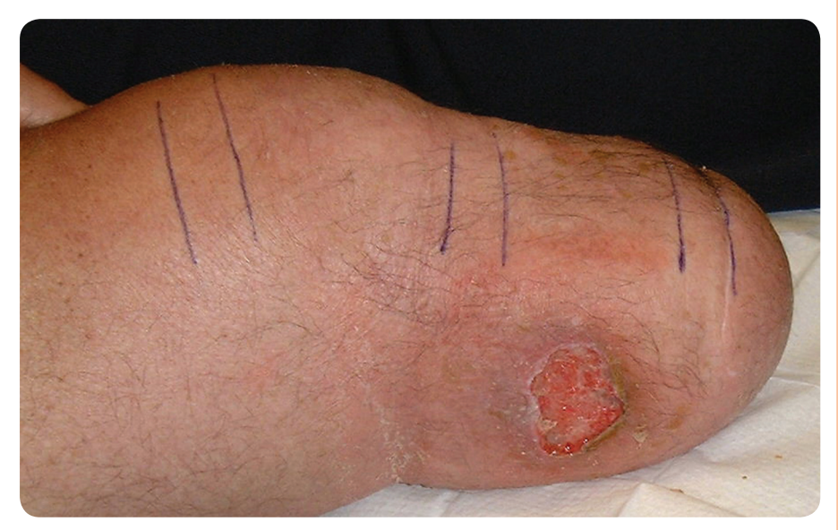
Figure 5. Shear and friction damage to stump from badly fitting prosthesis.

Three theories have been postulated to explain this process: