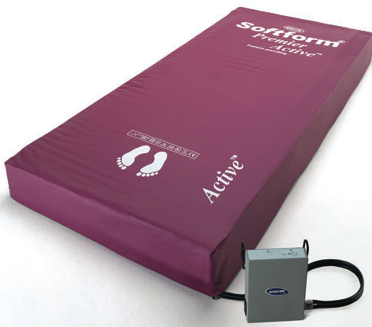
Figure 1. The Softform Premier Active mattress and pump.

Two major issues were identified as a result of the audit; the amount of time the patient spent sitting out of bed varied across the wards, as did the availability of pressure-reducing cushions for these patients. These issues were rectified via the provision of pressure-reducing seat cushions and all staff being advised that a patient should sit out for two hours, before being returned to bed for a