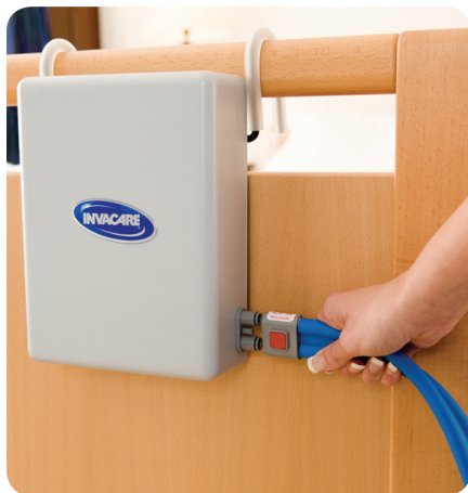
Figure 3. The portable pump with the on/off switch shown.

minimum of one hour. As a result of these interventions both wards had a comparable level of care provision before the start of the study, that was in accordance with best practice.