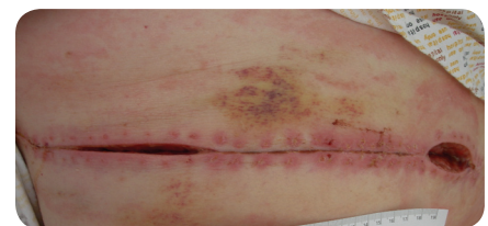
Figure 8. Patient 3 showing wounds that have dehisced at the medial and lateral suture line following an emergency nephrectomy.

The patient was obese and his wounds had dehisced at the medial and lateral suture line following an emergency nephrectomy (Figure 8). Surgeons were concerned that due to the patient's malnourished state (total protein level albumin = 24g/dl) the wound would develop fistulae. They stated that topical negative pressure dressings were not to be used. This posed a conundrum, since the lateral wound was very heavily exuding and required dressing changes three times per day of three hydrofibre