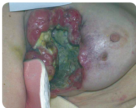
Figure 9. Heavily exuding fungating breast wound.

The four most common symptoms associated with fungating wounds are pain, malodour, bleeding and exudate (Hampton, 2004). The effective management of exudate from a