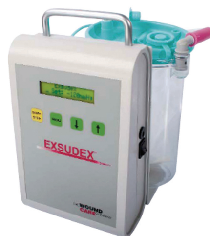
Figure 2. The Exsudex pump.

The dressing consists of Kerlix™ (Tyco Healthcare, Hampshire) which is moistened with sterile saline or water before application to the clean wound bed. This dressing conforms well to wound crevices allowing even distribution of negative pressure to