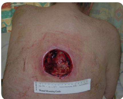
Figure 5. Patient 2: pressure ulcer midway between scapula and thoracic vertebrae.