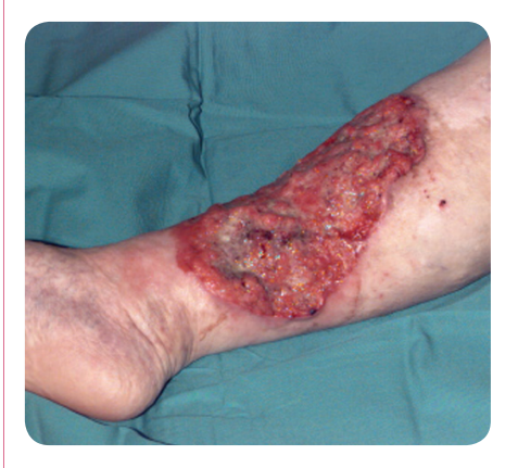
Figure 2. Non-healing venous leg ulcer over the medial aspect of the lower leg in a 71-year patient. Biopsy revealed a Marjolin's ulcer (squamous cell carcinoma) with metastasis in the groin and para-aortic lymph nodes.

Figure 1. Squamous cell carcinoma presenting as extensive ulceration over the shin of an elderly woman.