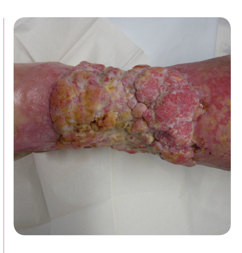
Figure 1. Squamous cell carcinoma presenting as extensive ulceration over the shin of an elderly woman.

Most SCC arise either spontaneously, from pre-existing skin lesions such as actinic keratosis (in situ SCC), or from a premalignant area of Bowen's disease (intraepidermal carcinoma) (Britto et al, 1998). Various predisposing factors such as solar radiation, infection with human papilloma virus and exposure to cytotoxic drugs, chemical hydrocarbons, tar, and mineral oils have been identified for the development of spontaneous SCC (Lumley, 1997; Mork et al, 2001) ( Table 1 ).