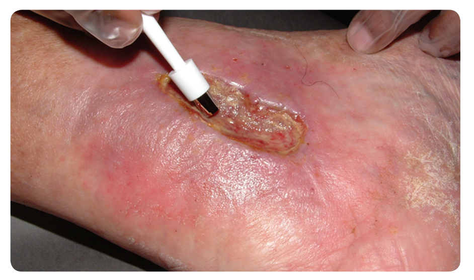
Figure 5. Punch biopsy being obtained from the base of a non-healing venous ulcer.

Biopsy of the suspicious lesions for histopathology remains the gold standard for diagnosing malignancy. Excision biopsy is the preferred method, although it is not always feasible either due to the size or location of the lesion, or due to the lack of technical expertise to obtain appropriate wound closure. In such