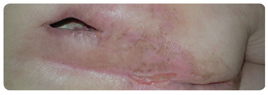
Figure 3. Grade 4 cavitated lesion with improving surrounding skin damage.

The trust's PU incidence system has been altered following March 2007 to comply with NICE (2005) guidance which requires the reporting of all EPUAP grade 2 and above pressure ulcers as clinical incidents. Changing the system and the method of calculating pressure ulcer incidence figures will be likely to affect the future ability to make true comparisons with earlier figures and to track whether outbreak patterns coincide at similar times