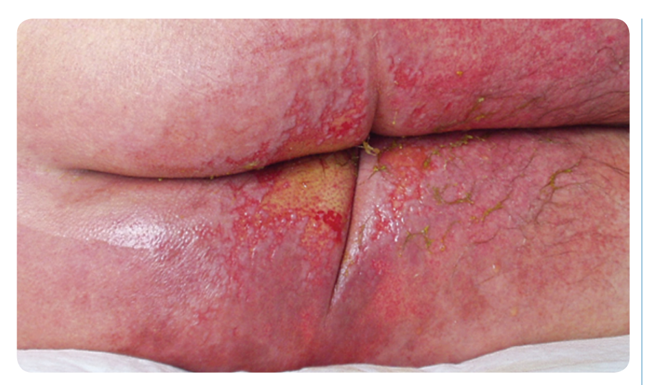
Figure 1. A moisture lesion.