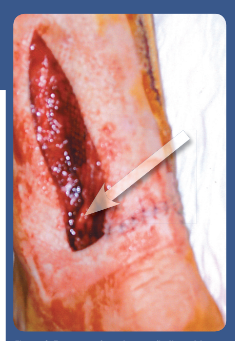
Figure 4. Exposure of sural nerve (indicated by arrow).

Frame JD, Frame JE (2006) Modifying Integra as a regeneration template in deep tissue planes. J Plast Reconstr Aesthet Surg