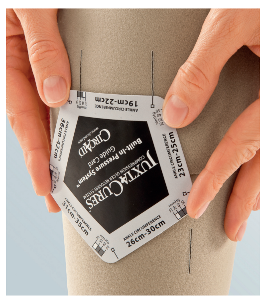
Figure 2. The built-in pressure system (BPS) card

Kimberley asked the audience how many of them would now consider using cloths in their practice. All but one of the delegates said that they would consider using them in their day-to-day practice in future.