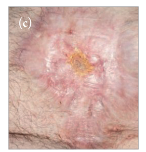
Figure 1. Mr JZ's abdominal wound 3 days (a) and 7 weeks (b) after epidermal harvesting. There was complete wound healing after 4 months (c)