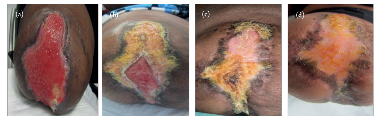
Figure 3. Mrs EB's amputation site 3 weeks post epidermal harvesting (a). Encrusting was visible and left undisturbed during re-epithelialisation (b) and (c). There was complete wound healing 16 weeks post epidermal harvesting (d)

grafts were transplanted using a soft silicone nonadherent dressing. After 7 days a 50% reduction in wound size was noted. A topical antimicrobial non-adherent povidone-iodine dressing was applied twice a week to prevent infection and promote moisture balance, together with a secondary basic gauze dressing and retention bandage.