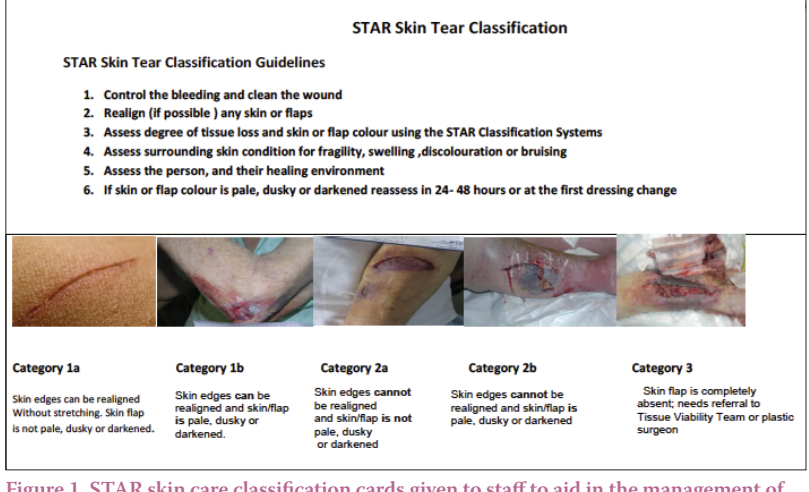
Figure 1. STAR skin care classification cards given to staff to aid in the management of skin tears (adapted from Carville et al, 2007)

management (Le Blanc et al, 2011). They can be complex in the elderly, particularly if the wound becomes infected or if the person has comorbidities that can lead to a delay in wound healing. Patients are often taken to accident and emergency or minor injury units for assessment and may require hospital admission.