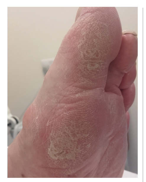
Figure 1. Anhydrosis.