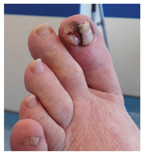
Figure 9. Chronic onychcryptosis.

nails) causing infection. Fungal infections tend to target the skin where there is contact with the shoe or between the toes ( Figure 6 ) (Anderson et al, 2010).