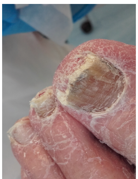
Figure 5. Fungal Infection of the skin and nails.

skin is often seen to be dry, flaky and prone to fissuring ( Figure 1 ) (Best Practice Statement, 2012). Anhydrosis can also be associated with systemic disease and illness, including: