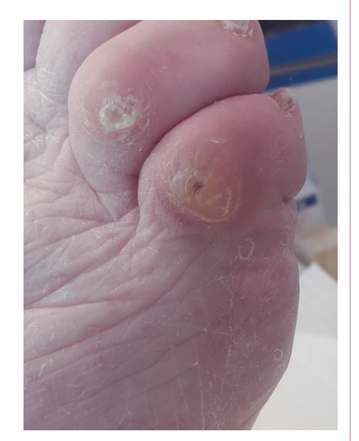
Figure 4. Heloma Durum (hard corns) on the tops of the toes.

in older adults due to an impaired ability to produce granulation tissue and a decline in the rate of epithelialisation (Best Practice Statement, 2012).