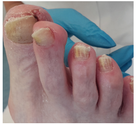
Figure 7. Onychomycosis (fungal nail) affecting several nails on the foot.

Fungal infection of the foot is common. Dermatophytes are fungi that invade and multiply within keratinised tissues (skin, hair, and