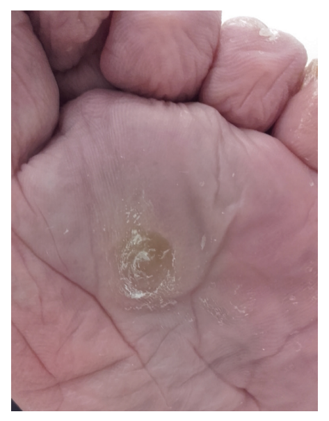
Figure 3. Plantar Callus over the 3rd Metatarsal Head (ball of the foot).

In advancing age, foot deformities, including halluxabductovalgus (bunions) and toe deformities,