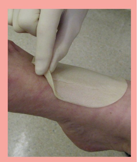
Figure 4a. To remove the hydrocolloid, gently lift the edge of the dressing.