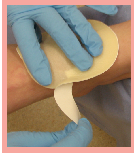
Figure 3. Applying a hydrocolloid dressing.