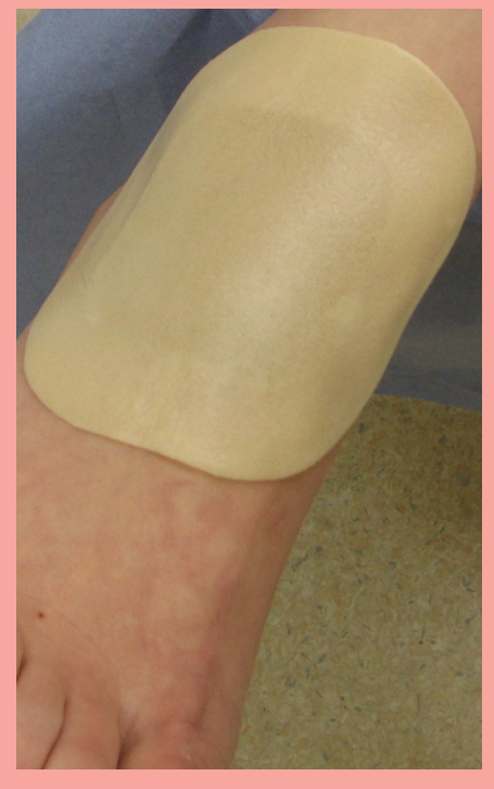
Figure 2. Hydrocolloid on the foot.