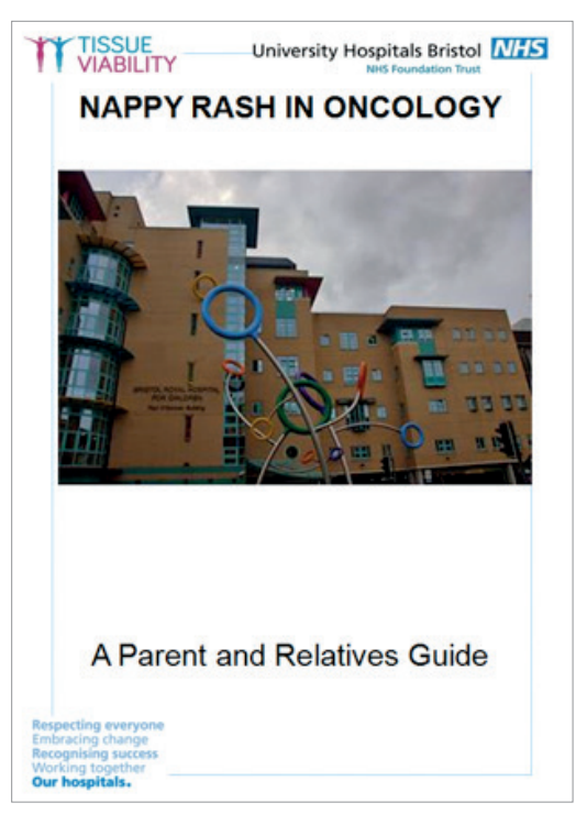
Figure 1. Leaflet created to educate parents/guardians about nappy rash and its treatment

A new training and education programme was instigated with the launch of these new tools to ensure staff had greater understanding and knowledge of NAD and how to follow the