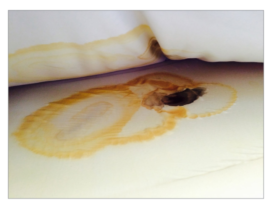
Figure 2. An example of a mattress with strikethrough.

the size and scope of the problem that it came to the attention of senior procurement and clinical managers (Stewart, 2010). In response, UK industry produced and promoted a guide the care, for cleaning and inspection of healthcare mattresses (BHTA, 2011). The aims of this report were supported by equipment manufacturers.