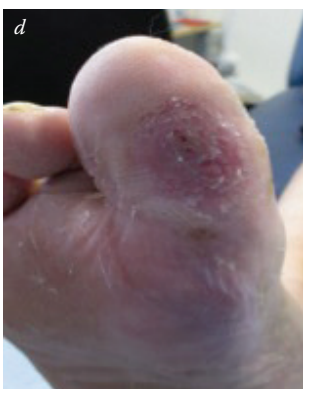
Figure 3a. Case one — Pre-TCC-EZ (November 18 2014). The wound measured 30mm x 18mm x 4mm. Figure 3b. One month after start of treatment with TCC-EZ (December 22 2014). The wound had decreased in size and now measured 20mm x 12mm <2mm. Figure 3c. Ulcer almost healed (January 13 2015), measuring 10mm x 5mm <2mm. Figure 3d. Ulcer healed 11 weeks (January 27 2015).

It took 6 weeks before he was seen in the orthopaedics department and he was placed into TCC. Once healed, he remained ulcer-free until January 2014, at which time the area broke down due to mechanical trauma. He was not referred back to Podiatry once his ulcer had healed and following the appearance of the new ulceration he did not contact Podiatry for another 4 months, at which stage he reported repeated infections with deterioration to the ulcer.