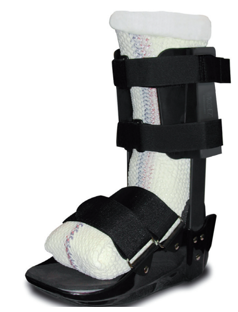
Figure 2. TCC-EZ casting device.