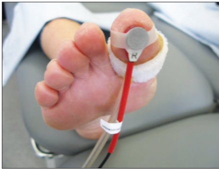
Figure 4. Machine for taking TBPI.