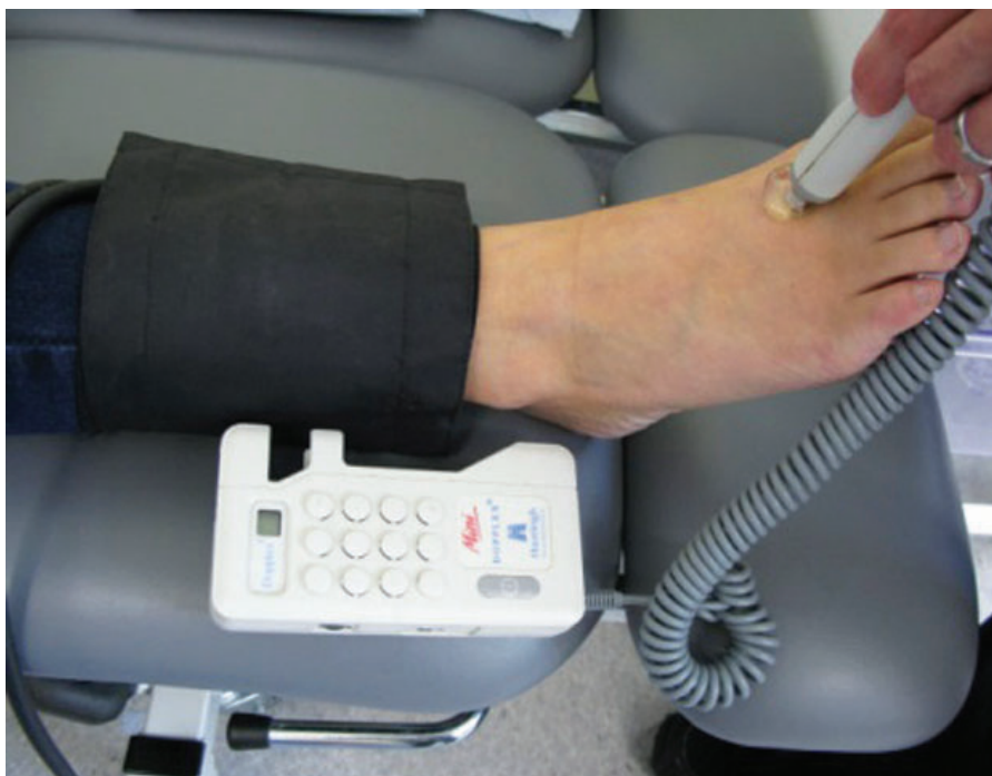
Figure 1. The cuff should be positioned over the ankle area to obtain the ABPI.