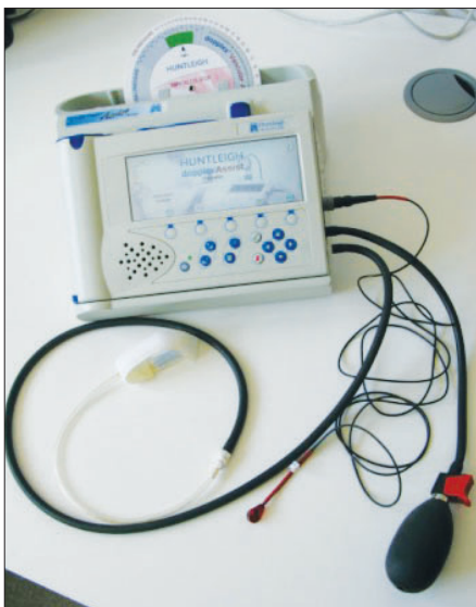
Figure 5. TBPI taken with hand-held Doppler and appropriate sized cuff.

should be used alongside either the posterior tibial pulse or peroneal pulse. Again, a reading should be taken from both legs in order to attain a picture of the person's whole arterial system, with the highest foot pulse in each leg being used for the measurement.