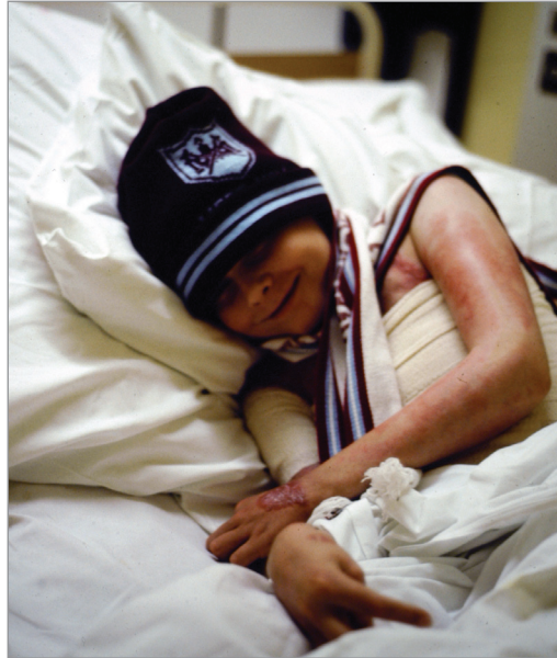
Figure 2. Young child with autism that would not receive treatment unless wearing his hat and scarf.

“A lack of understanding regarding the child’s individual needs, reduced ability to play, inability to communicate through play and rational thought-processing, all impacts on length of hospital stay.”