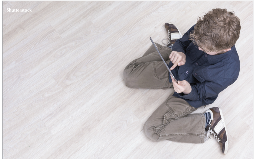
Figure 4. Digital communication tools have proven to be extremely useful when interacting with autistic children.

It is imperative to support staff that care for children and young people with autism. A child or young person with a major burn injury requires a vast amount of technological support and invasive care strategies. However, staff must see past the technological aspects and focus on the child and family, how best to communicate with them and