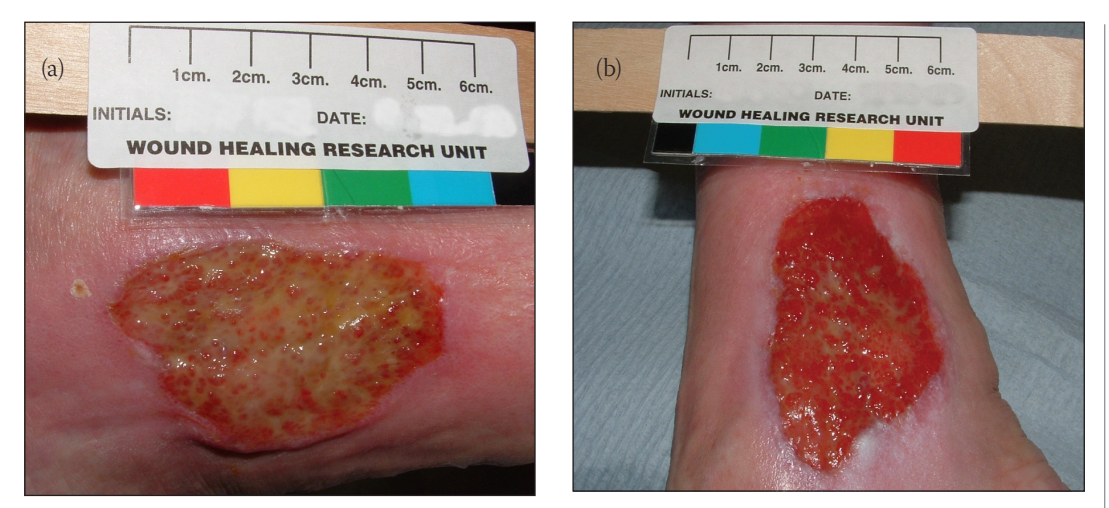
Figure 2. (a) Patient with ulcer of 4 months duration which measured 15.8 cm<sup>2</sup> at day 0. (b) After 10 days, slough decreased and granulation tissue increased.

maximum of 25.32°C (SD 0.94, day 14). The surface temperature at the wound site increased over the course of treatment from a mean temperature of 29.03°C (SD 1.35, day 0) to 29.76°C (SD 1.06, day 14), this increase was statistically non-significant (t=1.61, df=9, P =0.14). The elevated surface temperature was not mirrored by increased skin blood flow around the wound site with mean blood flow reducing over the 14 days from a mean flux of 28.30 arbitrary units (SD 35.11) to a mean of 20.05 (SD 11.45, on day 14).