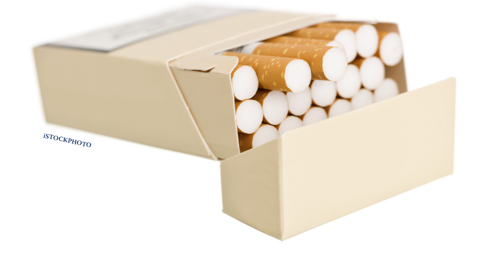
Figure 2. Smoking is a risk factor for postoperative complications, such as pneumonia, infections and impaired wound healing. These can be reduced by pre-operative stop-smoking intervention 6 to 8 weeks before surgery.

"Trials investigating smoking cessation and wound healing have found universal improvements in reducing infection rates, complications and speed of wound healing."