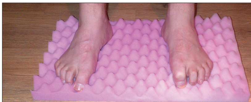
Figure 1. Many patients automatically gripped the foam with their toes.

Many of the patients automatically gripped the foam with their toes and felt using the foam encouraged them to move their feet (Figure 1). Evaluation data at the end of the 2-month period are summarised in Table 2 and Box 3.