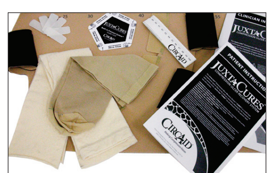
Figure 1. Juxta CURES (medi UK).

With all this choice available, it should be possible for the practitioner to select a suitable compression system that their patients find comfortable to wear but, in practice, patients often find compression difficult to tolerate. There is clear, documented evidence outlining the many reasons for this, such as not understanding the theory of compression, increased pain on application, previous poor experience of therapy, and social pressures, such as being unable to work (Hopkins and Worboys, 2005; Moffatt, 2007; Moffatt et al, 2009).