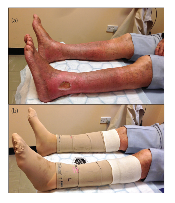
Figure 3. Mr C's leg (a) with, and (b) without, Juxta CURES (medi UK) applied.

There will always be patients who find it difficult to adhere to compression, despite it being considered the best treatment option for their leg ulcers. Juxta CURES is an alternative to bandages and stockings. This case study review only examined complex cases; Juxta CURES was not used routinely as a first-line treatment option to provide compression therapy as current local protocol is to use compression bandages. Nurses and patients in the author's clinic report Juxta CURES to be quick and easy to apply, making it likely to reduce the amount of time clinicians spend on dressings and the number of clinic visits patients require. There is no reason why this device cannot be used for routine venous leg ulcer management.