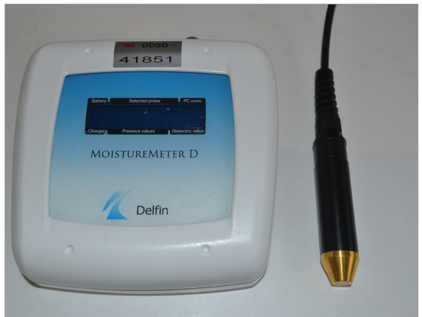
Figure 2. Delfin Moisture MeterD with XS 5 Dielectric Probe.

differed from the first SIE. This trend continued through successive SIEs, with the mean Cavilon Durable Barrier Cream (3M) results remaining in the 5–15 range, while the results for the other barrier products increase through successive simulated incontinence episodes to 25–30 dielectric constant.