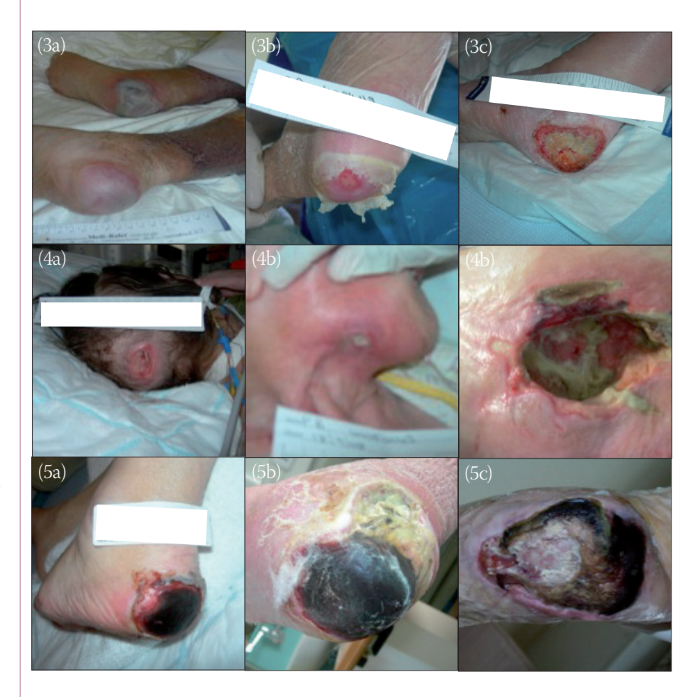
Figure 3. All category II pressure ulcers (PUs). a) Serous-filled blister, appears pink with no darker tissue visible. (b) A spontaneously deroofed blister revealing a superficial ulcer with dermal slough. (c) PU on heel with brown slough, not easily removed. Figure 4. All category III PUs. (a) PU on the occiput; appears superficial but the arrow indicates fascia. (b) PU to the lower jaw, which exposes fascia. (c) Deep cavity PU reveals a mixture of necrotic and clean tissue. Figure 5. (a) The presence of necrotic tissue over the heel prevents definitive grading. It is a minimum category III PU, as the full-thickness skin is necrotic. However, on debridement, it may be category IV, depending on the depth of the ulcer and which tissue structures are revealed. (b) Extensive skin and soft tissue necrosis preventing definitive categorisation of pressure damage until the necrotic tissue is debrided. (c) Partial debridement of necrotic soft tissue has exposed the calcaneum (heel bone), revealing a category IV PU. There is a high risk of osteomyelitis when bone is exposed.

Shuster S, Black MM, McVitie E (1975) The influence of age and sex on skin thickness, skin collagen and density. Br J Dermatol 93(6): 639–43