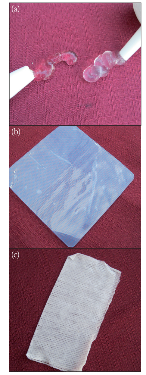
Figure 1. Hydrogels are available in a number of formulations: (a) semitransparent amorphous gel; (b) sheets; (c) impregnated dressings.

Hydrogels can also be used in painful wounds as they have a cooling, soothing effect, and also reduce pain (Trudigan, 2000).