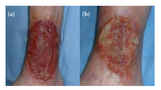
Figures 4. (a) Patient C's left lateral ulcer shown at presentation of the Diving Diseases Research Centre; (b) and after 60 hyperbaric oxygen therapy treatment.

These cases suggest that HBO can be beneficial for chronic wounds with no obvious hypoxic component. However, the use of HBO as an adjunct therapy in wound care should be carefully considered and outcomes closely monitored. Patient history and comorbidities,