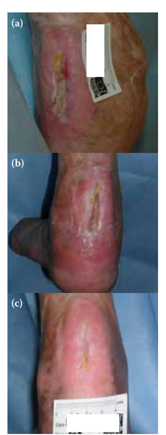
Figure 2. (a) Patient A's wound at presentation to the Diving Diseases Research Centre (DDRC) with 90% slough; (b) after 40 hyperbaric oxygen (HBO) treatments with 30% slough; (c) and at 1-year follow-up with 90% epithelialisation.

Figure 1. View of a hyperbaric oxygen therapy chamber.