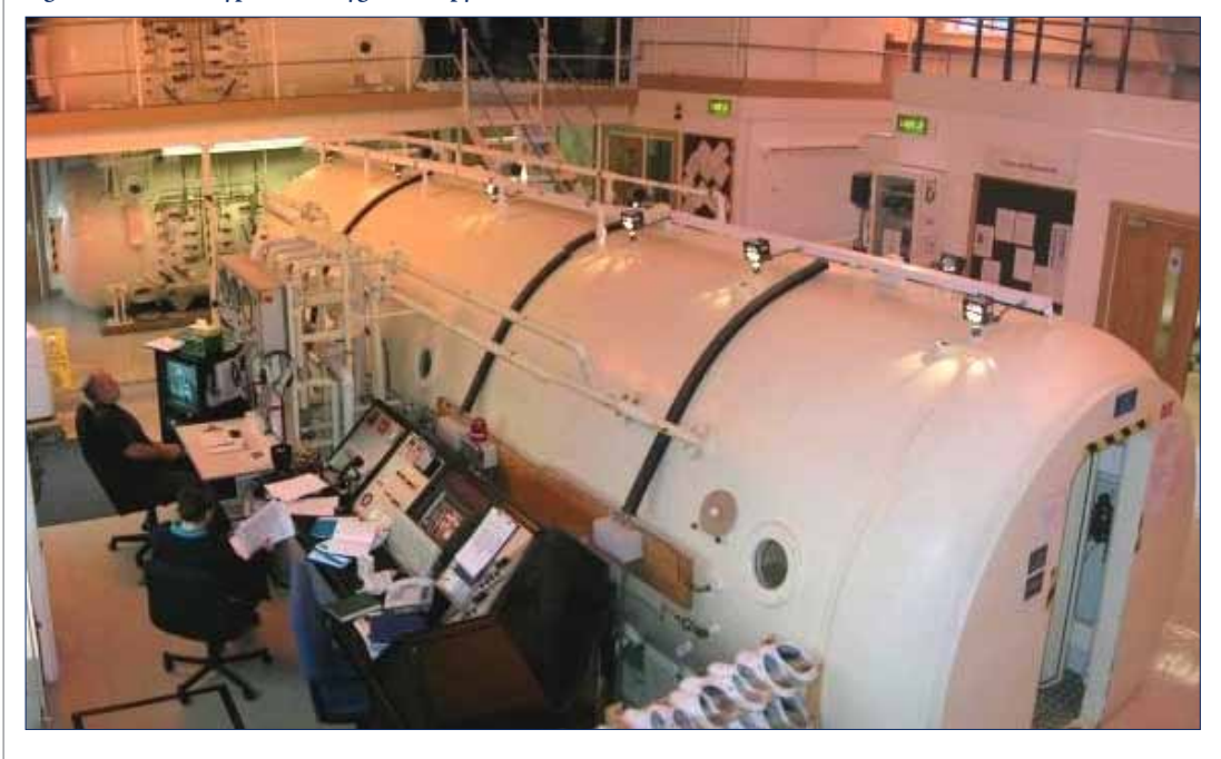
Figure 1. View of a hyperbaric oxygen therapy chamber.