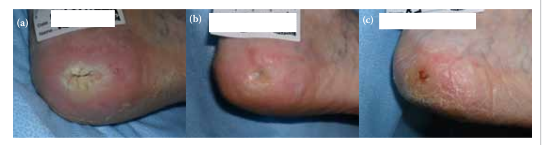
Figure 3. (a) Patient B's wound at presentation to the Diving Diseases Research Centre. (b) The wound's depth reduced from 1.2 cm to 0.3 cm after 40 episodes of hyperbaric oxygen therapy (HBO). (c) The wound 4 months after completion of the course of HBO showing 90% epithealisation.

than acute wounds, even when not showing clear signs of infection (Edwards and Harding, 2004). Therefore, the increased oxygenation of the wound during HBO may allow the patient's immune system to more effectively combat infection. For example, Patient B's recurrent infections ceased during HBO, suggesting a change in his ability to fight infection.