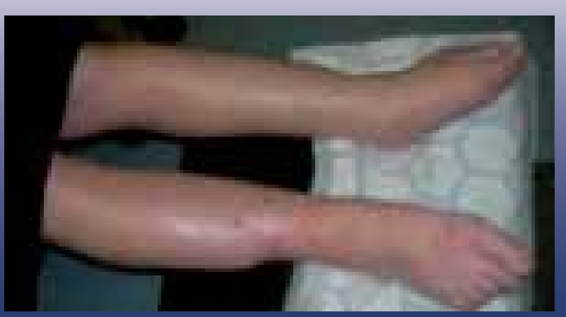
Figure 2. Poor practice: The patient's legs have been elevated on a footstool, with pressure to the heels and no support under the leg.

Wingfield (2009) Chronic oedema and the importance of skin care. In: Skills for practice; management of chronic oedema. Wounds UK Supplement, Aberdeen 13–19