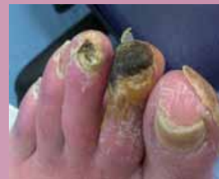
Figure 4: Ischaemic foot with ischaemic rubor (redness) and necrosis of second and third digits.