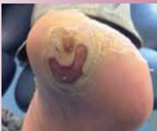
Figure 7: Diabetic foot ulceration, secondary to the wearing of new footwear.

In addition, patient education on diet, exercise, smoking cessation and tight glycaemic control is imperative to lower the risk factors for long-