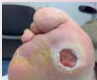
Figure 2: A typical neuropathic DFU on a weight bearing area of the forefoot with macerated edges.

McIntosh and Newton (2006) suggest additional signs, such as cellulitis, lymphangitis, purulent exudates and pus/abscess, to be synonymous with infection in the diabetic foot. Early management with intensive systemic antibiotic therapy is advised for non-healing progressive ulcers with signs of infection (NICE, 2004). To minimise the risk of contamination by surface