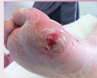
Figure 5: Diabetic ulceration with osteomyelitis in a neuroischaemic foot.

Ousey and McIntosh (2008) suggest vascular control is staged via provision of pharmacological agents, lifestyle changes, such as quitting smoking, increased activity, revascularisation