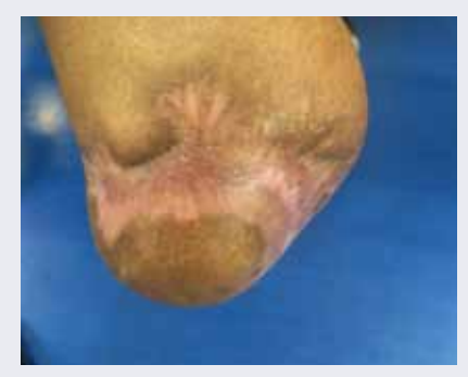
Figure 4: Healed wound.