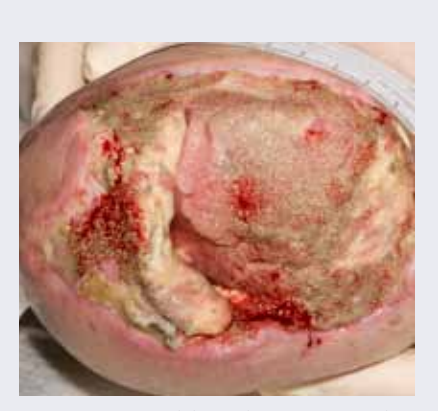
Figure 7: Large dehisced stump wound.