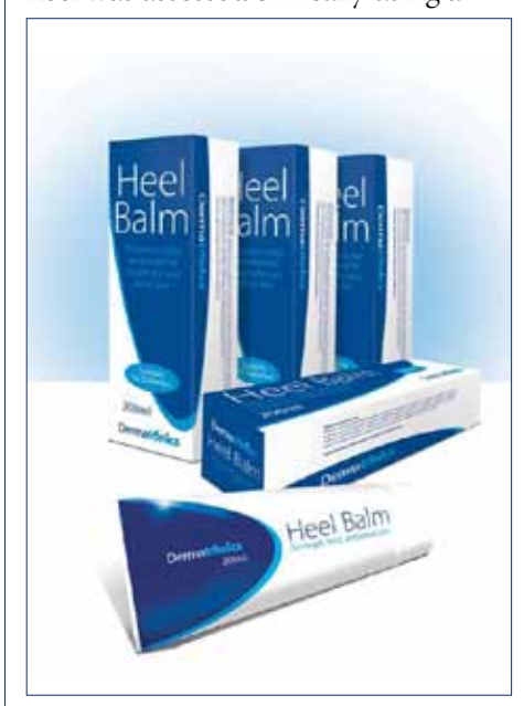
Figure 1. The Heel Balm used as Treatment A in the study.

The posterior part of each subject's heel was assessed clinically using a