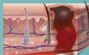
Figure 1. Examples of pressure ulcers, categories 1–4.