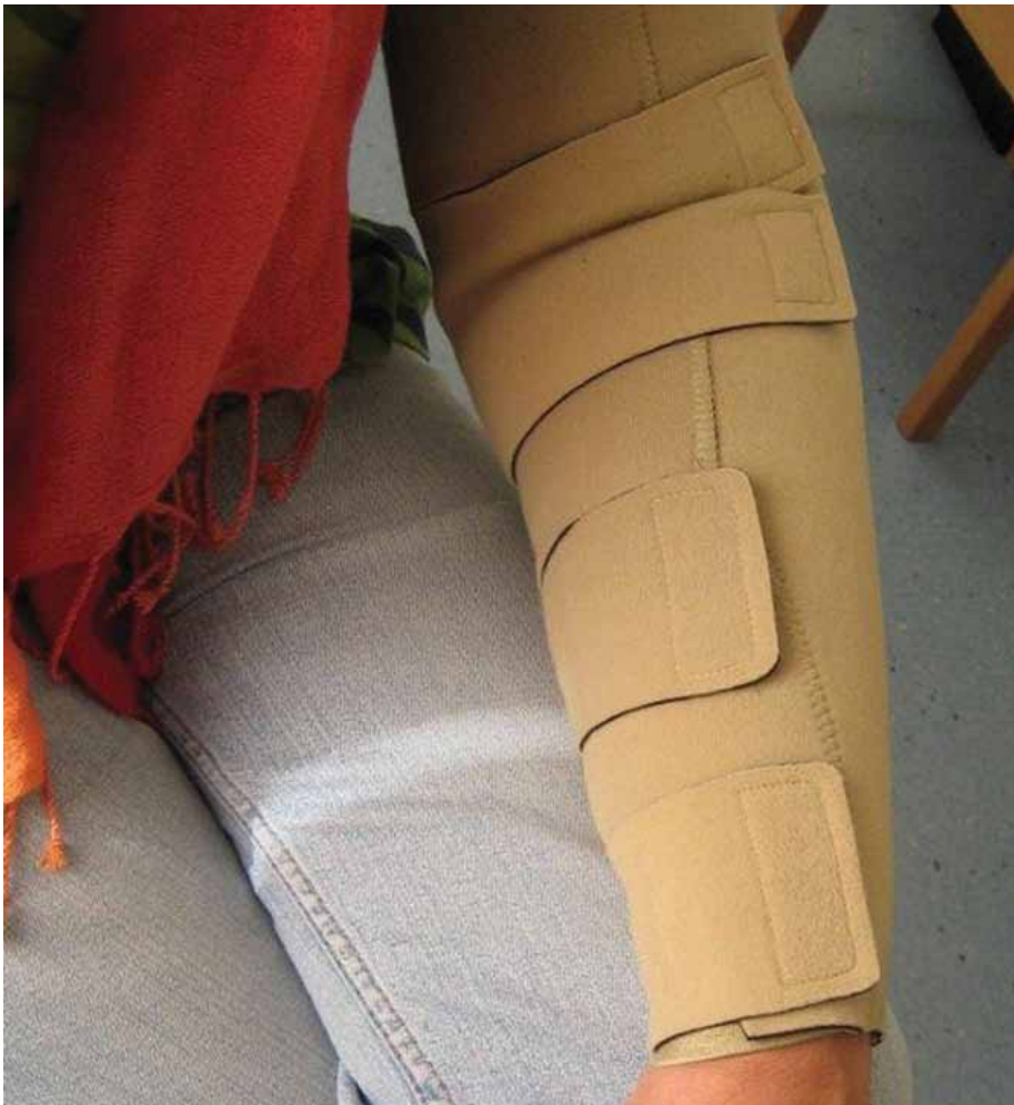
Figure 9. Juxta-armsleeve.

which is where Ms B's oedema was at its most problematic. It was decided to trial the use of the shelf straps in an innovative fashion; the aim being to add a wall around the dorsal swelling, without creating a tight squeeze over the potentially vulnerable toe area.