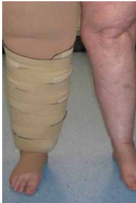
Figure 3. Lymphoedematous limb with Juxta-Fit applied.

The Juxta-Fit range from CircAid® (available from medi UK) is an easy-