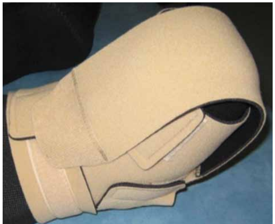
Figure 8. Juxta-Fit ankle footwrap with shelf strap in situ.

She had a distorted foot shape with an area of stubborn oedema to the distal part of both feet. The oedema hung over the toes and was more prominent on the dorsum of the foot ( Figure 6 ). The decision was made by Ms B and her lymphoedema therapist to try the Juxta-Fit ankle foot wrap, as the foot wrap ends at the base of the toes,