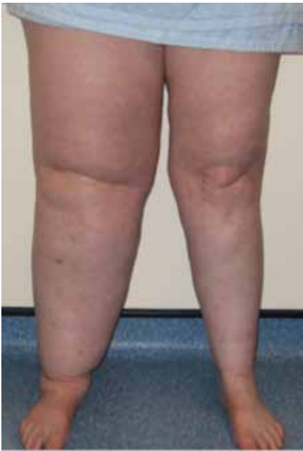
Figure 2: Excess volume of 70% compared with contralateral limb.

shape after it has been stretched. Compression garments exert pressure on the leg because of this elasticity, which is related to the extension of the compression yarn, and the circumference of the leg.