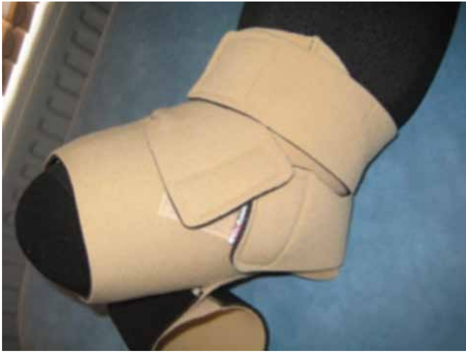
Figure 7. Juxta-Fit ankle footwrap with shelf strap anchored at the patient's plantar aspect.

the Juxta-Fit hourly initially, and to wear it as much as possible during the day. After one month of wearing Juxta-Fit as advised, Mrs A felt that her leg was softer. The limb volume measurements showed a reduction of 30% down to 40% excess compared with the contralateral limb and, more importantly, the tissues were soft and mobile. The foot remained the same and oedema had not increased in this area.