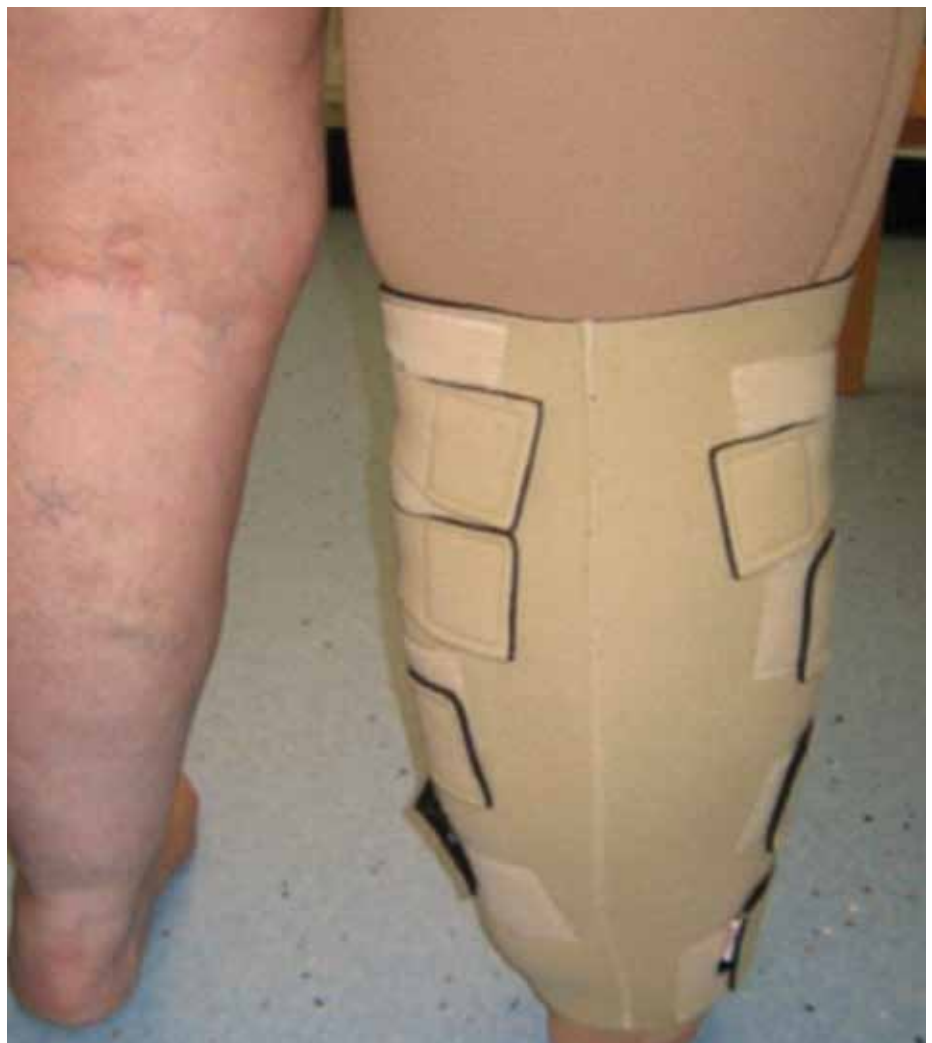
Figure 4. Back view of the device — the Velcro bands can be individually re-adjusted for optimum comfort for the wearer.

Juxta-Fit is made from a patented latex-free fabric that has limited stretch. This creates a stiff outer layer, which prevents oedema formation.