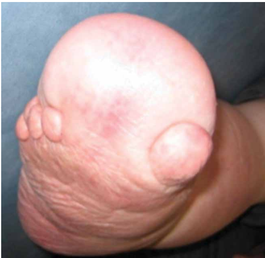
Figure 6. Distorted foot shape.

bands known as 'Juxta-lock' (Figure 1). These guarantee simple application for patients and/or carers as the device can be easily readjusted throughout the day without having to undo the entire garment, thereby promoting self-management. The more a patient is able to readjust throughout the day, the greater the volume loss in the