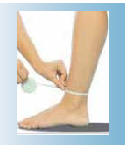
Figure 5: Measuring the narrowest part of the ankle.