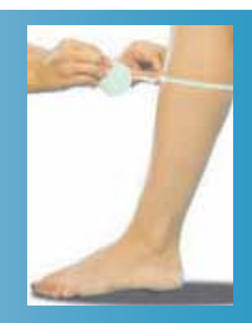
Figure 6. Measuring the widest part of the calf.