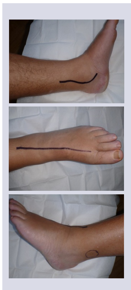
Figure 2: This image shows the location of the posterior tibial artery.

Figure 3: These markings indicate where the tibial artery continues as the dorsalis pedis in the foot.