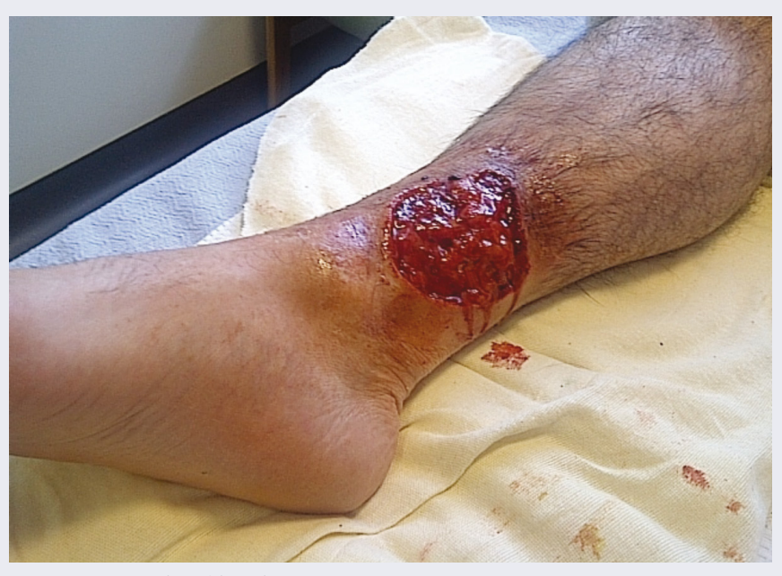
Figure 5: A simulated leg ulcer.

group of pharmacists who had noticed her regularly buying large rolls of gamgee.