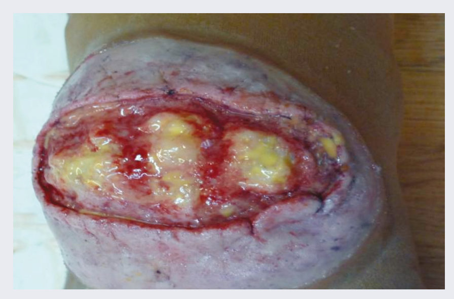
Figure 3: A necrotic pressure ulcer on the heel of a foot.