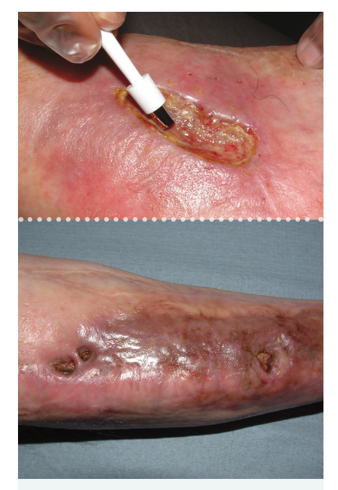
Figure 1: Although malignant leg ulcers are uncommon, malignancy should be ruled out when ulcers fail to heal after 12 weeks of treatment.

Particularly in patients with pre-existing eczema and dermatitis. Studies have now