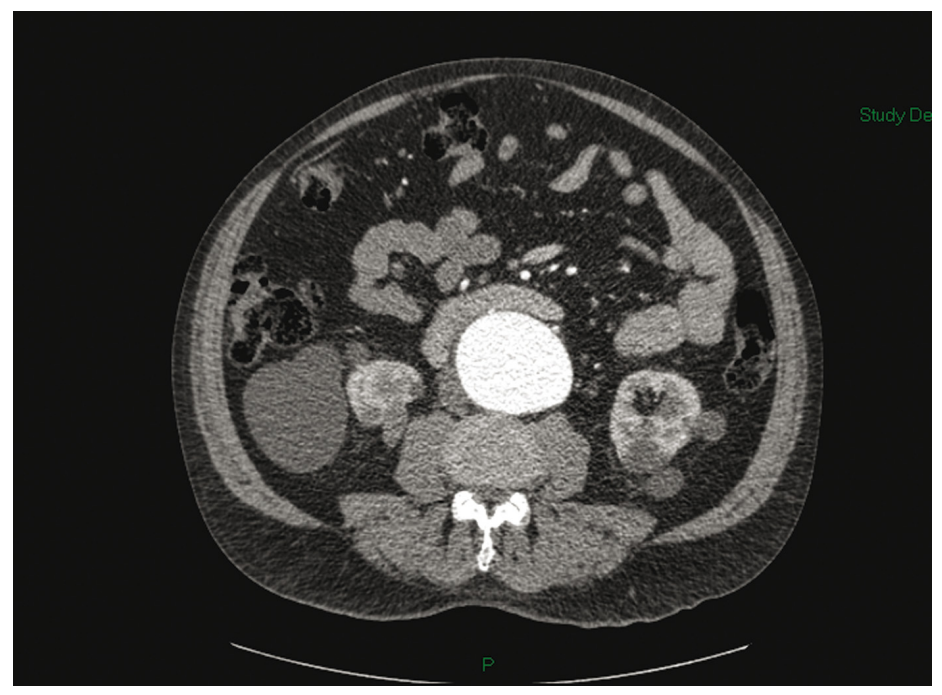
Figure 5: A computer tomography (CT) angiography is a quick and non-invasive test that can be used to reconstruct three-dimensional images of the peripheral vessels.

difficulty in delineating the length of an occlusion in the presence of calcification.