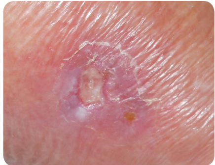
Figure 8. Case 5: vulnerable skin.

Of concern with any adhesive dressing is that it may lose its adhesion and expose the wound bed, or allow fluid to leak from the wound. In this case series it was found that the