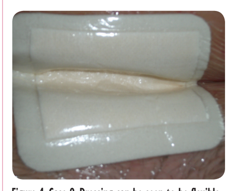
Figure 4. Case 9: Dressing can be seen to be flexible.