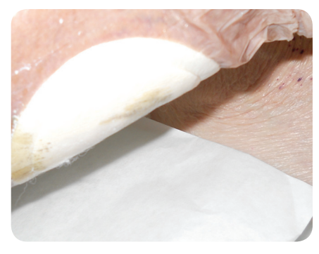
Figure 2. Case 6: dressing in situ with exudate being contained.

(Mölnlycke Health Care)/Comfifast® toe-to-knee orthopaedic padding and a further layer of toe-to-knee Tubifast/ Comfifast, or similar. This method reduces soft pitting lower limb oedema, preventing the oedema from