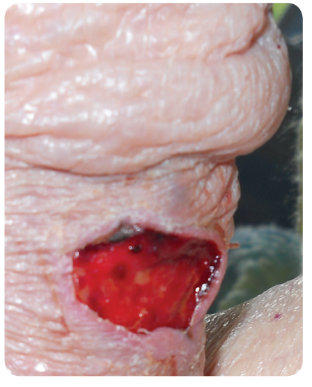
Figure 9. Case 6: vulnerable skin.

dressing adhered securely to the periwound and showed no signs of falling off. Figure 4 shows the dressing's flexibility, while in Figure 5 the dressing can be seen to have conformed to the folds of the skin (case 9). In cases 13–15 the dressing adhered to the heel, but also allowed the patient to wear footwear and mobilise, as the dressing profile was acceptable and not too bulky.