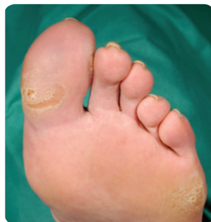
Figure 7. Complete healing after three weeks of treatment.

at dressing change, thereby ensuring that the surrounding fragile skin and newly-formed granulation tissue is protected.