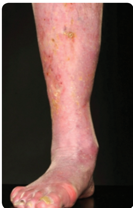
Figure 4. Fully healed after eight weeks of treatment.

in the author's clinical experience, foam dressings provide the perfect balance between fluid-handling capabilities and maintaining moist wound healing.