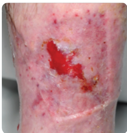
Figure 3. Mr W's ulcer at four weeks since referral.