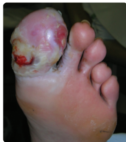
Figure 6. 48 hours after treatment with Advazorb.