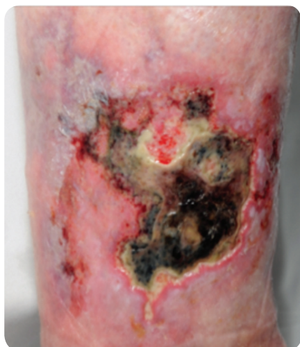
Figure 2. Ulcer at presentation.