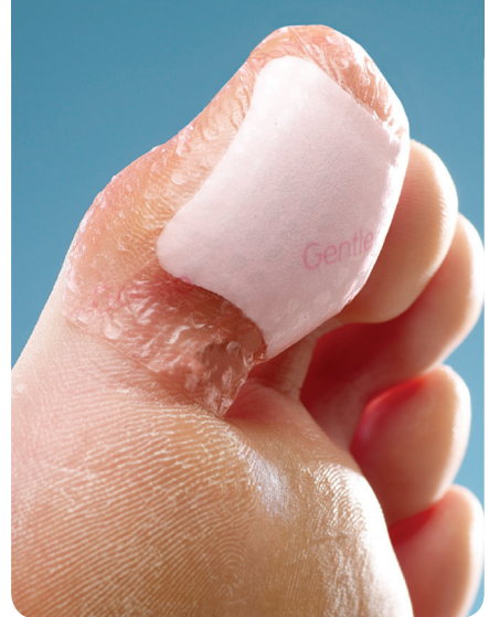
Figure 1. Examples of Allevyn Gentle Border Lite on awkward to dress areas.

While in vitro data is important, the impact of wound care should