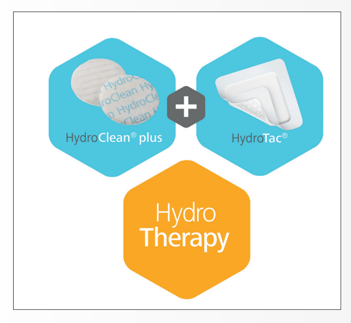
Figure 1. What is HydroTherapy?

components found in chronic wound exudate are responsible for tissue maceration (Rippon et al, 2016). Wounds exposed to free fluid (e.g. wounds covered with chambers into which saline is added) appear to benefit from many of the positive aspects of moist wound healing (Junker et al, 2013).