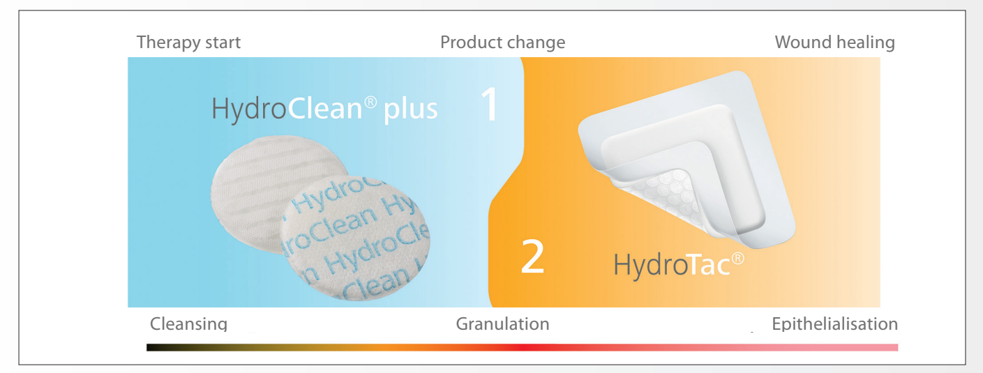
Figure 2. How does HydroTherapy work?

HydroTac<sup>®</sup> is a HRWD with AquaClear Technology. The dressing is made up of a hydrogel wound contact layer, covered